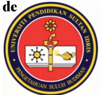
Sultan Idris Education University, Malaysia