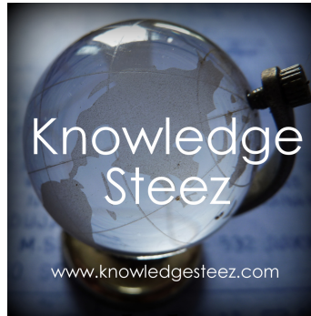
Knowledge Steez EduHub, India