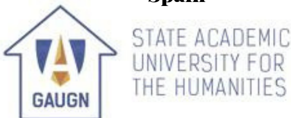
State Academic University for the Humanities, Moscow