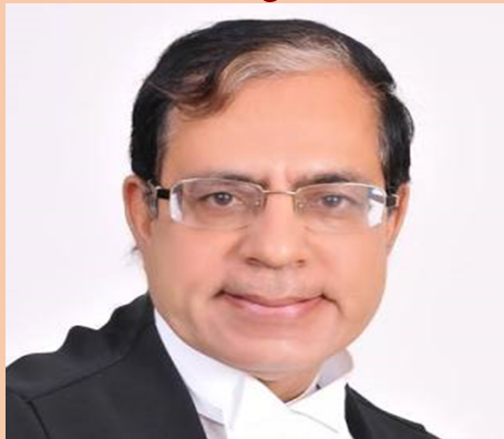
Hon'ble Mr. Justice A.K. Sikri, Former Judge Supreme Court of India