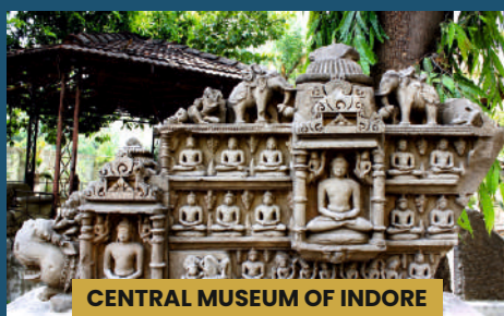
CENTRAL MUSEUM OF INDORE