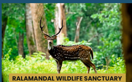
RALAMANDAL WILDLIFE SANCTUARY