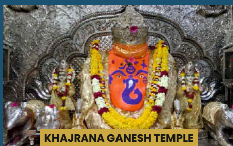
KHAJRANA GANESH TEMPLE