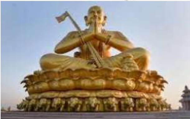
Statue of Equality