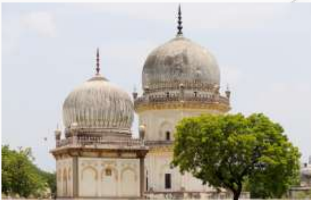
Qutub Shahi Tombs