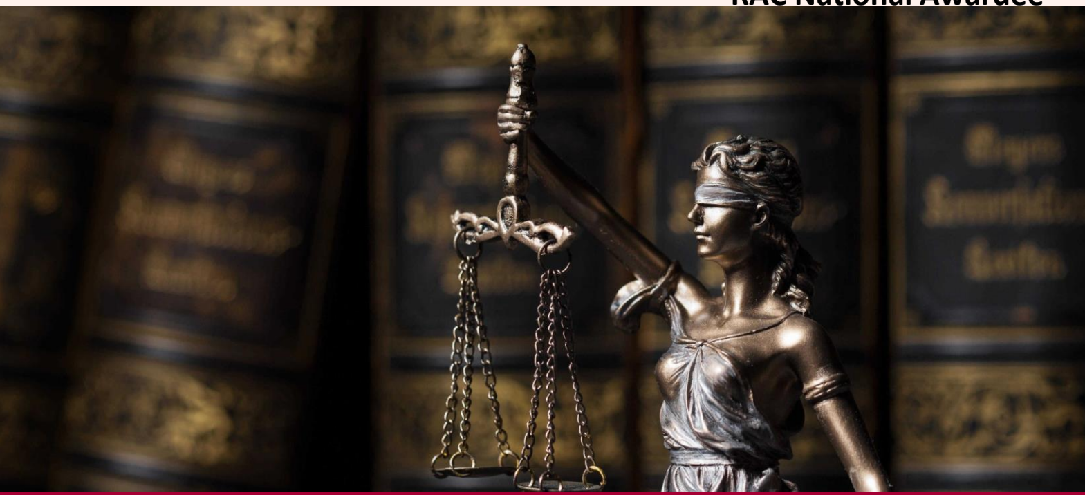
Saluting the Trailblazers Who Brought the First Moot Court to Life at CGC Jhanjeri