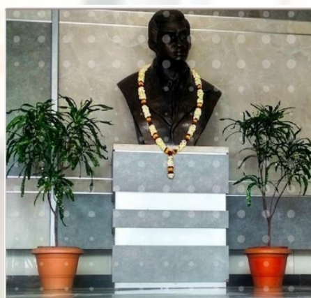
SRINIVASA RAMANUJAN 22 DECEMBER 1887 - 26 APRIL 1920

In pursuit of its vision: "Discover, Empower, Transform: Building A Better World", Ramanujan College is today perceived as one of the best colleges in the country.