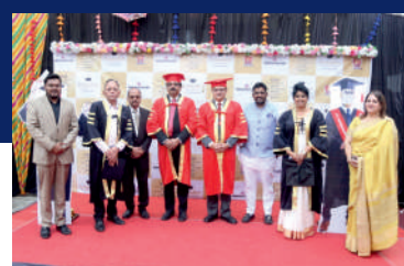
Hon'ble Justice Abhay S. Oka Judge Supreme Court of India Graduation Ceremony Date : 14 th October 2023