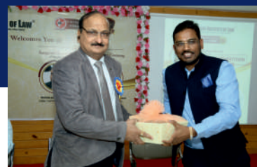
Hon'ble Justice Anil Verma Judge High Court of Madhya Pradesh Smt. Nirmala Devi Bam Memorial Moot Court Competition Date : 21 May 2023