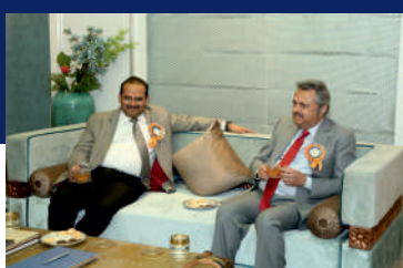
Hon'ble Justice Ravi Malimath Chief Justice of Madhya Pradesh High Court Lex Bonanza International Law Fest Date : 09 to 11 December 2022