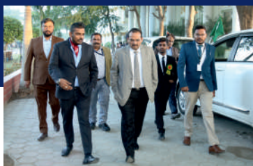
Hon'ble Justice J. K. Maheshwari Judge Supreme Court of India Lex Bonanza International Law Fest Date : 09 to 11 December 2022