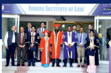
Hon'ble Justice C. T. Ravi Kumar Judge Supreme Court of India Graduation Ceremony Date : 18 th February 2023