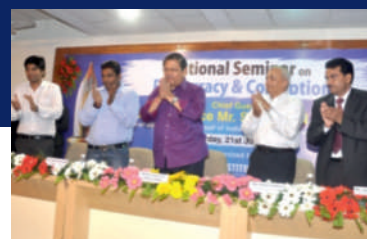
Hon'ble Justice Santosh Hegde Supreme Court of India The National Symposium on "Democracy & Corruption" Date: 21st July, 2012