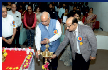
Hon'ble Justice Dinesh Maheshwari Former Judge Supreme Court of India Smt. Nirmala Devi Bam Memorial Moot Court Competition Date : 21 May 2023