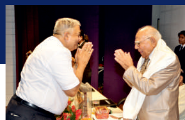
Mr. Ram Jethmalani Member of Parliament Sr. Adv., Supreme Court of India The National Symposium on "Money Laundering Regulations - A Tool to Curb Corruption in India" Date: 14th April, 2012