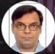
Hon'ble Justice Debangsu Basak Judge, High Court at Calcutta