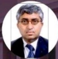
Hon'ble Justice Soumen Sen Judge, High Court at Calcutta

National Conference on Legal Education, Profession and Integrating Pro Bono Culture for Better Access to Justice April 8th-9th, 2023