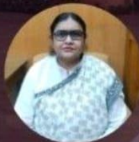
Hon'ble Justice Ananya Bandyopadhyay Judge, High Court at Calcutta