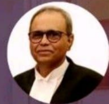
Hon'ble Justice Joymalya Bagchi Judge, High Court at Calcutta