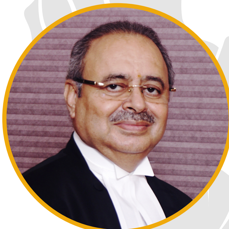
HON'BLE MR. JUSTICE RITU RAJ AWASTHI

HON'BLE UNION MINISTER OF STATE FOR ELECTRONICS AND INFORMATION TECHNOLOGY & UNION MINISTER OF STATE FOR SKILL DEVELOPMENT AND ENTREPRENEURSHIP, GOVT. OF INDIA