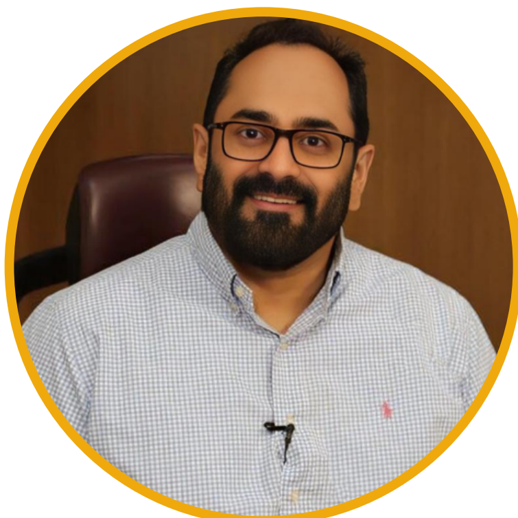
HON'BLE SHRI RAJEEV CHANDRASEKHAR

HON'BLE UNION MINISTER OF STATE (I/C) FOR LAW & JUSTICE, PARLIAMENTARY AFFAIRS AND CULTURE, GOVT. OF INDIA