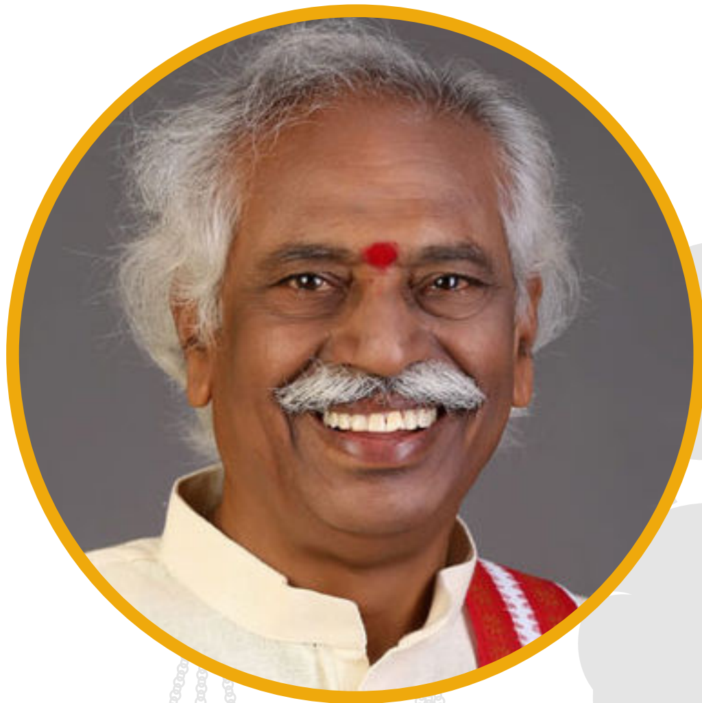
HON'BLE SHRI BANDARU DATTATRAYA

HON'BLE GOVERNOR OF HARYANA & CHANCELLOR, DR. B.R. AMBEDKAR NATIONAL LAW UNIVERSITY, SONEPAT