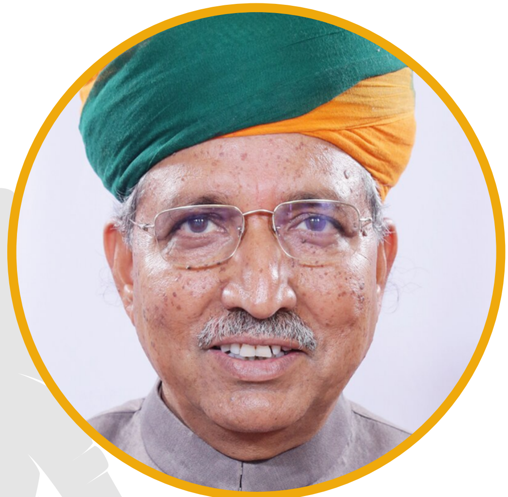
HON'BLE SHRI ARJUN RAM MEGHWAL

HON'BLE GOVERNOR OF HARYANA & CHANCELLOR, DR. B.R. AMBEDKAR NATIONAL LAW UNIVERSITY, SONEPAT