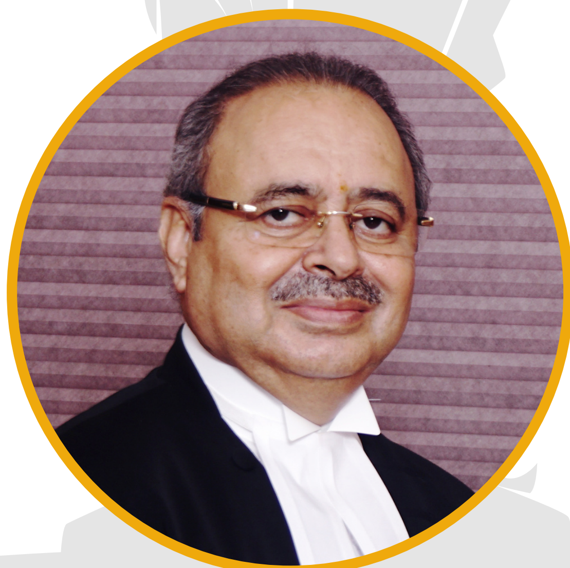
HON'BLE MR. JUSTICE RITU RAJ AWASTHI

Law Commission of India is constituted by the Department of Legal Affairs, Ministry of Law & Justice, Government of India with a definite term of reference to carry out research in the field of law. The Commission makes recommendations to the government in the form of reports. The Law Commission has submitted various reports on important issues in relation to the development of law. Presently, it is engaged in dealing with various important issues, such as Uniform Civil Code, simultaneous Elections, Trade Secrets, etc. The Law Commission of India provides excellent, thought provoking, and vital review of the laws in India. The current 22nd Law Commission of India is headed by Hon'ble Mr. Justice Ritu Raj Awasthi, Former Chief Justice of the Hon'ble Karnataka High Court.