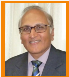
Justice S Ravindra Bhat Former Judge, Supreme Court of India