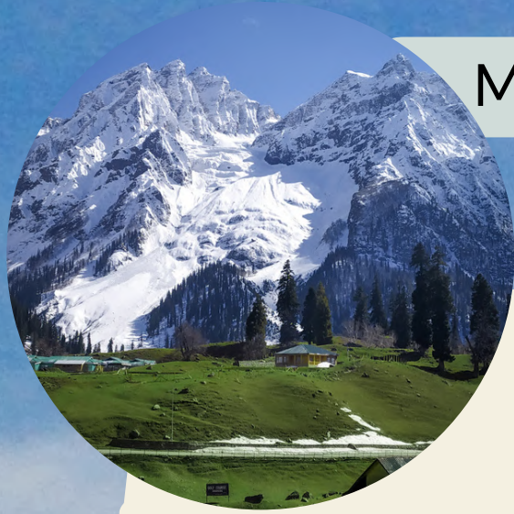
Mountains in Kashmir 4