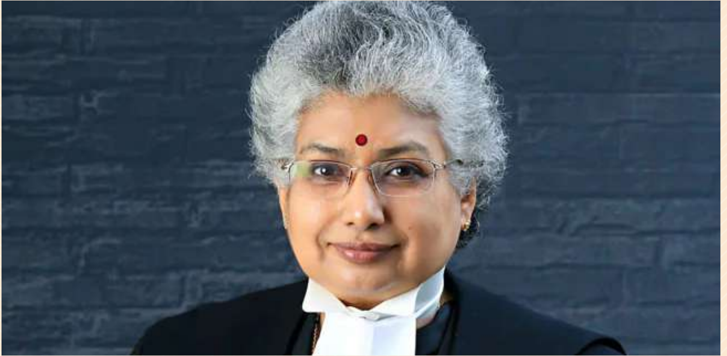
Hon'ble Mrs. Justice B.V. Nagarathna Judge, Supreme Court of India

Justice Bangalore Venkataramiah Nagarathna, born on October 30, 1962, in Bengaluru, is a distinguished judge of the Supreme Court of India. She also served as Amicus Curiae in significant cases, showcasing her commitment to justice. Elevated as an Additional Judge of the Karnataka High Court in 2008, her lordship's tenure witnessed remarkable contributions, including her role as President of the Karnataka Judicial Academy and Bangalore Mediation Centre.