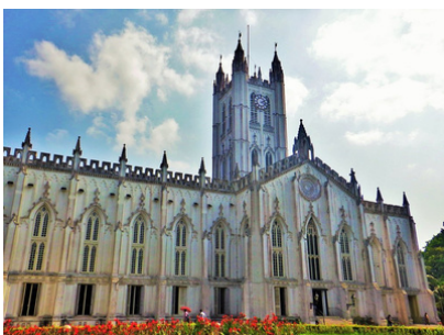
St. Paul's Cathedral