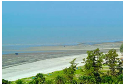
Bakkhali Sea Beach