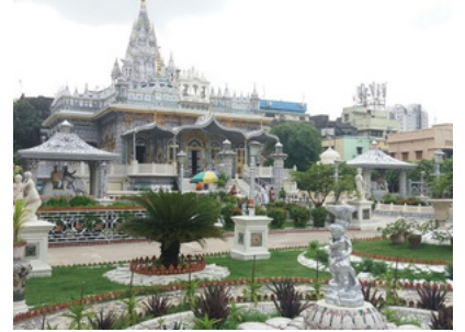
Jain Swetamber Dadajika Temple