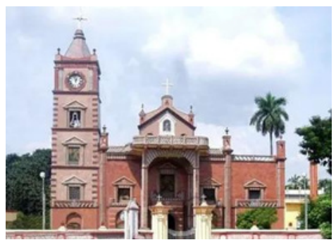
Basilica of the Holy Rosary