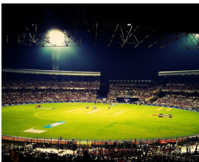
Eden Garden Stadium