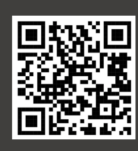
SCAN TO REACH ALC

Army Law College, Sai Sevadham, Old Pune Mumbai Highway, Kanhe, Pune- 412106.