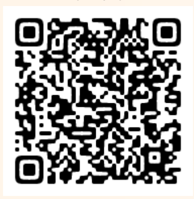
Scan to Register For Internal