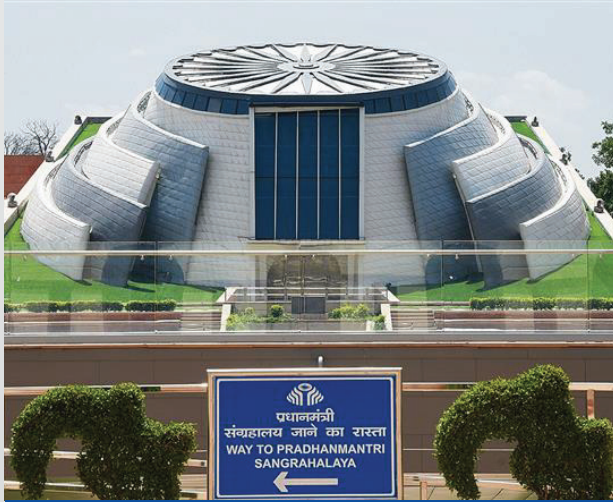
PRIME MINISTER MUSEUM