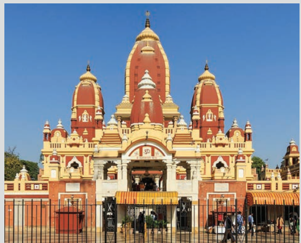
LAKSHMINARAYAN BIRLA MANDIR