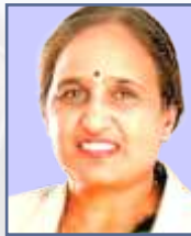
HON'BLE JUSTICE MRS. RENU AGARWAL Former Justice High Court of Judicature Allahabad