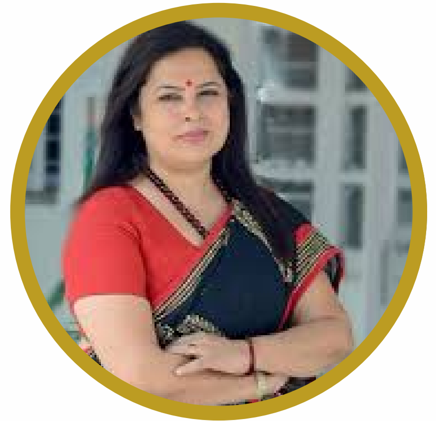
Chief Guest Ms. Meenakshi Lekhi Senior Advocate Former Minister of State for External Affairs Government of India