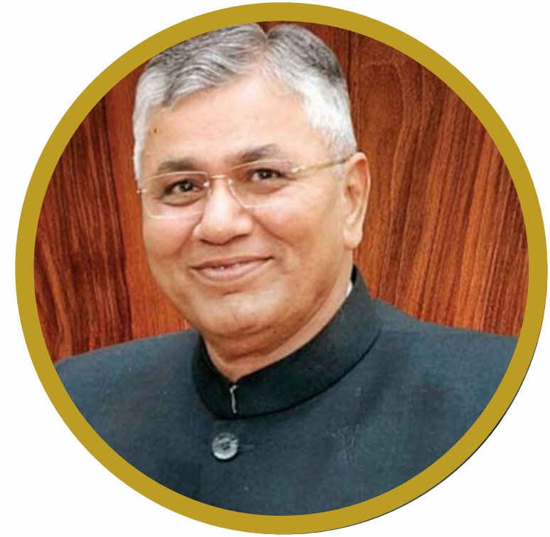
Special Guest of Honour Shri P P Chaudhary Senior Advocate Former Union Minister of State for Law & Justice Government of India