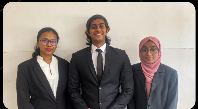
Faculty of law, University of Colombo, Sri Lanka