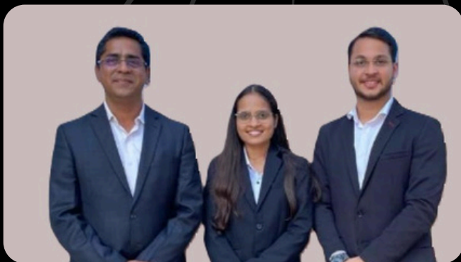
Victor Dantas Law College, Kudal, India