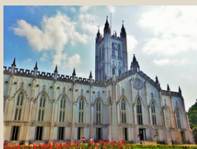
St. Paul's Cathedral