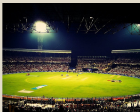
Eden Garden Stadium