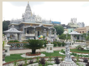
Jain Svetamber Dadajika Temple