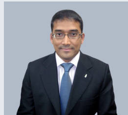
HON'BLE JUSTICE SOMASEKHAR SUNDARESAN Additional Judge, Bombay High Court