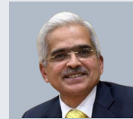
SHAKTIKANTA DAS Governor Reserve Bank of India