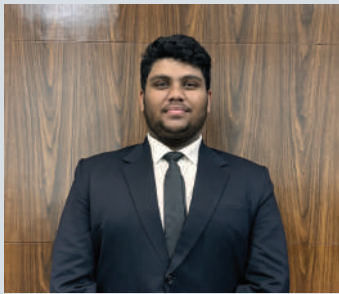
VH ANAGH Member