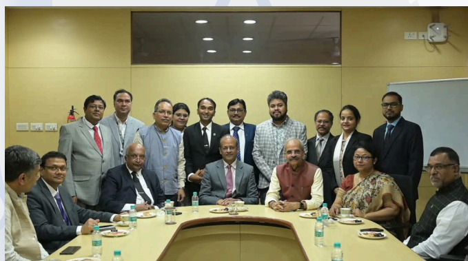
Inauguration by Hon'ble Mr. Justice Rajesh Bindal, Judge, Supreme Court of India