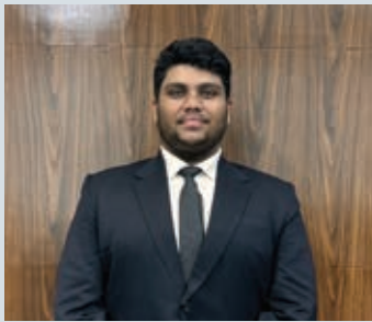
VH ANAGH Member