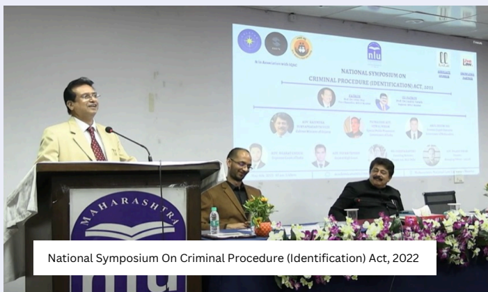
National Symposium On Criminal Procedure (Identification) Act, 2022

The Centre for Advanced Legal Studies, Training, and Research (CALSTAR) at MNLU Mumbai, is established with a visionary objective to create a comprehensive and unified platform for all academic, research, and training activities related to the dynamic and evolving field of law. The Centre envisions becoming a leading centre of excellence in legal education and research, contributing to the development of contemporary and futuristic legal frameworks that address emerging challenges in the legal landscape. It strives to bridge the gap between theoretical legal studies and practical application, ensuring that legal professionals are well-equipped to meet the demands of a rapidly changing world.