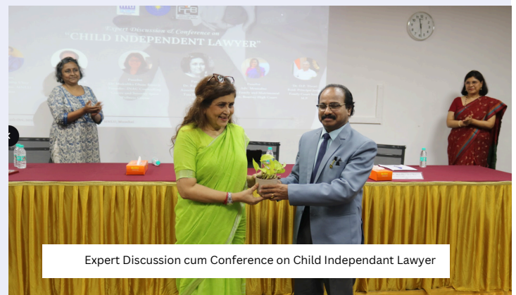
Expert Discussion cum Conference on Child Independent Lawyer