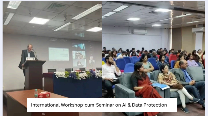
International Workshop-cum-Seminar on AI & Data Protection