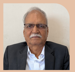
Former Judge High Court for the State of Andhra Pradesh