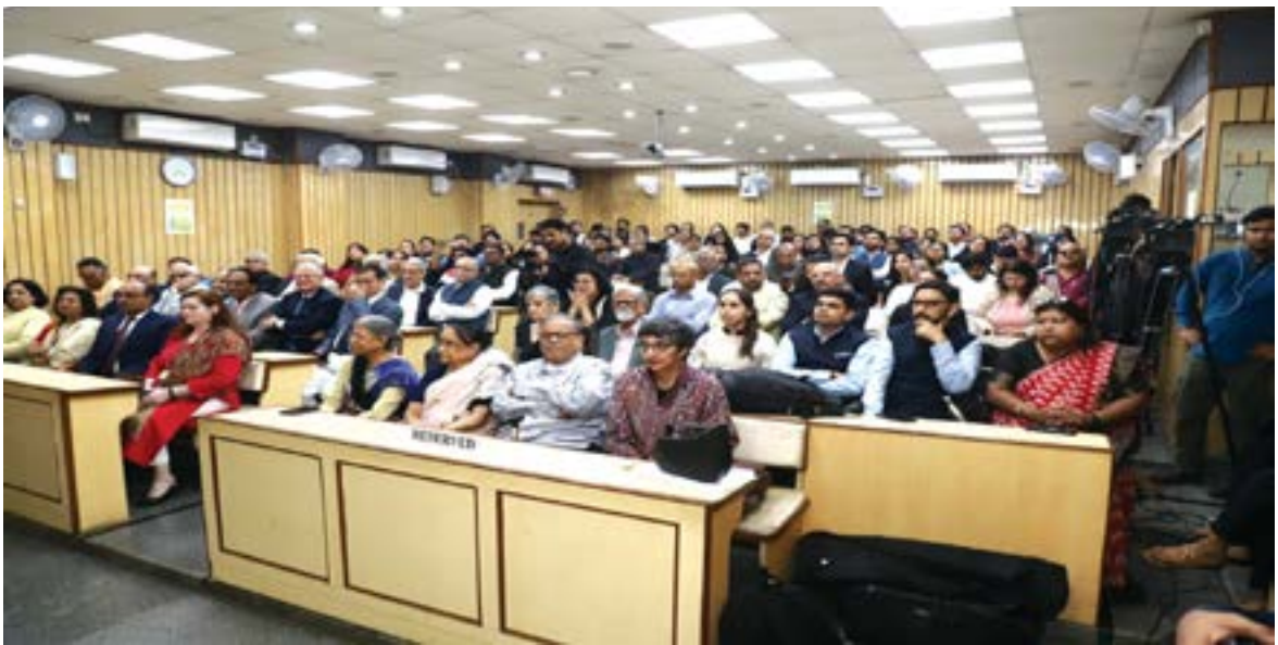
Snippets from the Programme