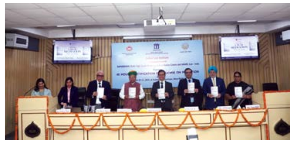
Dignitaries at the Dais