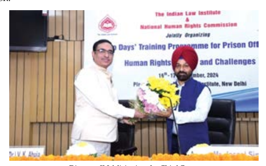
Director, ILI felicitating the Chief Guest

The Indian Law Institute (ILI) in collaboration with the National Human Rights Commission (NHRC) organized a two-day training programme on "Human Rights: Issues and Challenges" for prison officials on November 16-17, 2025. The programme was held at the Plenary Hall of the Indian Law Institute, New Delhi, bringing together distinguished speakers and experts from various fields to address critical aspects of human rights in the context of prison administration.