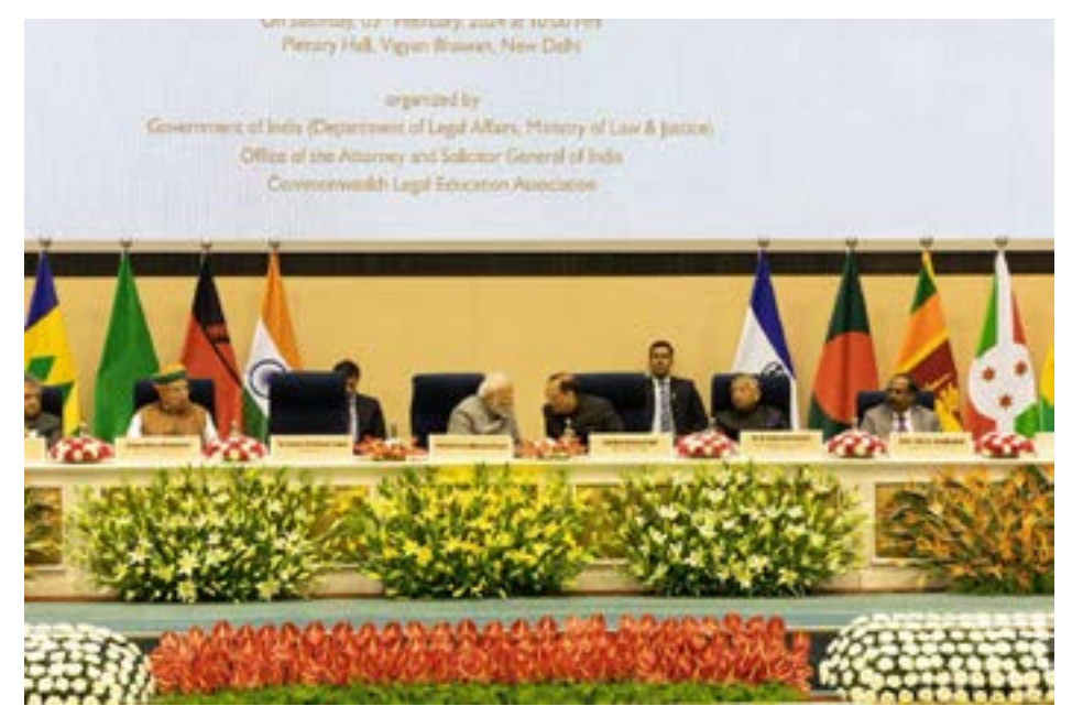
Dignitaries at the inaugural Session of the CLEA-CASGC'24 Conference.

The conference culminated with a notable valedictory ceremony with the august presence of Smt. Droupadi Murmu, Hon'ble President of India and Shri Amit Shah, Hon'ble Minister for Home Affairs, Government of India.