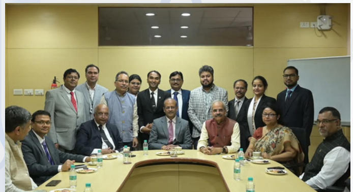
Inauguration by Hon'ble Mr. Justice Rajesh Bindal Judge, Supreme Court of India