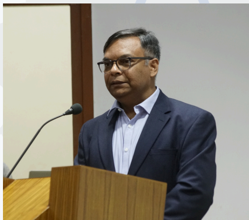
Hon'ble Justice Basak