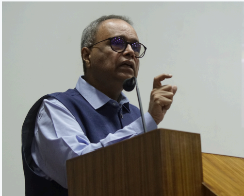
Hon'ble Justice Bagchi