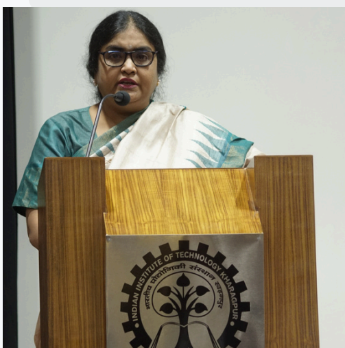
Hon'ble Justice Bandyopadhyay