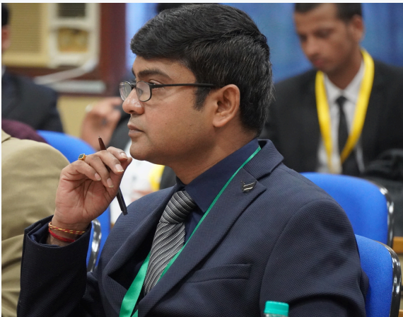
Session Chairs and Participants during Paper Presentation Sessions