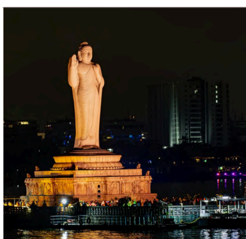
HUSSAIN SAGAR LAKE