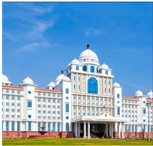
TELANGANA STATE SECRETARIAT