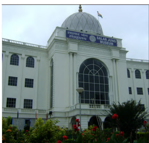
SALAR JUNG MUSEUM